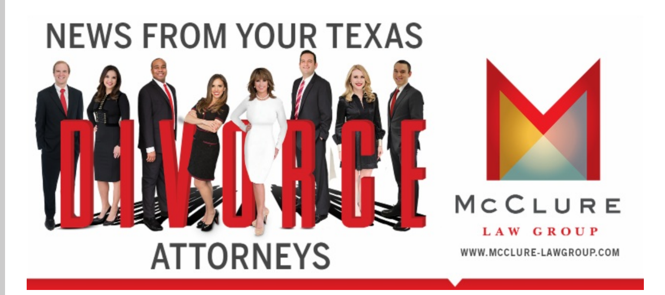
McClure Law Group Newsletter | July 2019

You may unsubscribe if you no longer wish to receive our emails.